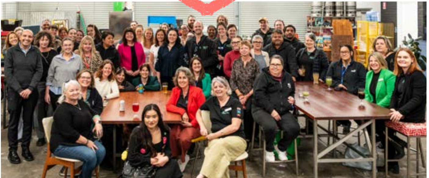
The amazing group of people that make up St Pat's Staff Team at a recent get-together